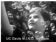
UC Davis M.I.N.D. Institute